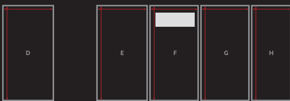
FRONT OF STORE