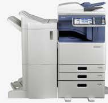
Copiers & Scanners (rental or purchase)