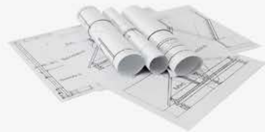
Drawing & Document Specs