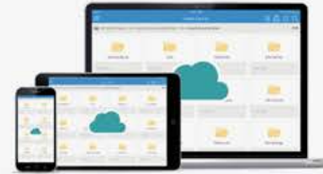
Scanning & Archive