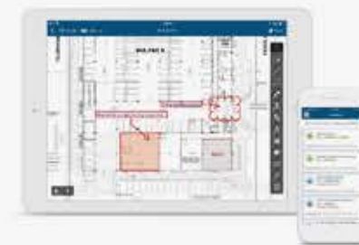
Project Management Software - SKYSITE®