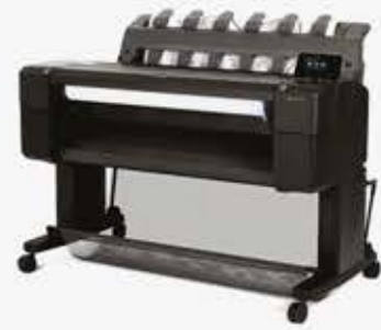
Plotters (rental or purchase)