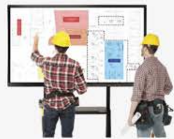
Digital Touch Screen SKYSITE® SmartScreen